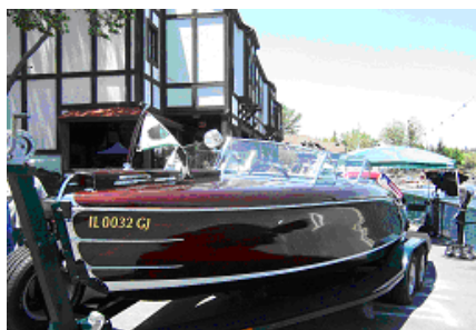
The featured boat Billy Bea II